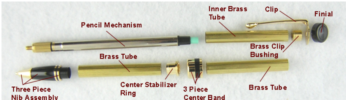
Flat Top American Pencil Parts Diagram

Needed: Mandrel-B Bushings-1B (1B-bushing sizes: cap clip bushing-0.485", cap center band bushing-0.485", barrel center band bushing-0.385", barrel tip bushing-0.385"). Drill-O Wood Size-5/8" x 5/8" Square x 5" Long